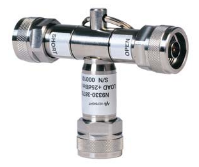
T-combo' open/short/50 \Omega load