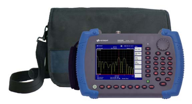
Soft carrying case