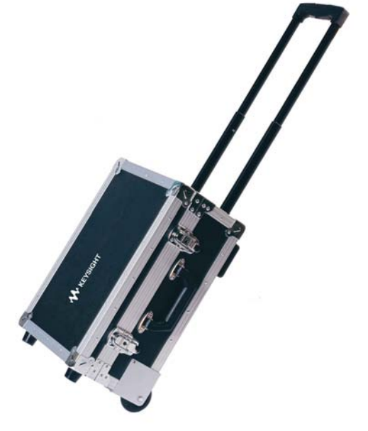
Hard transit case