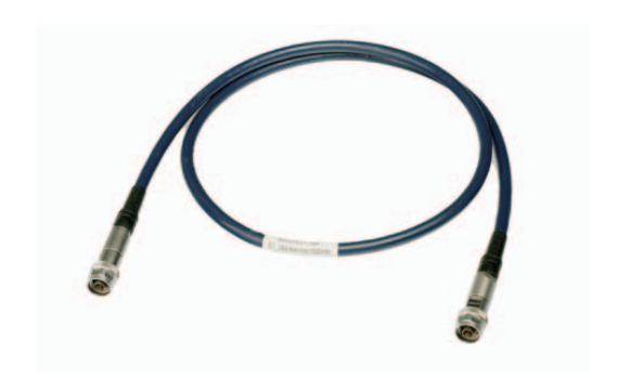
Phase-stable extension cable