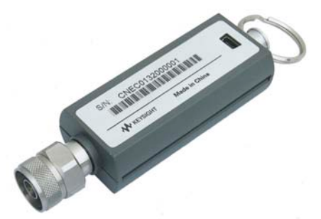
N9330B-203 Electronic calibrator