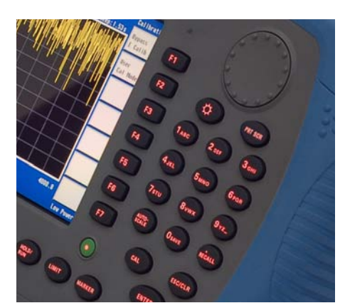
Well organized front-panel with more hard buttons and function keys for faster access to essential test functions.