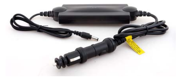
Automotive 12 V DC adaptor