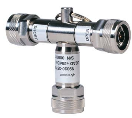
'T-combo' open/short/50 Ω load