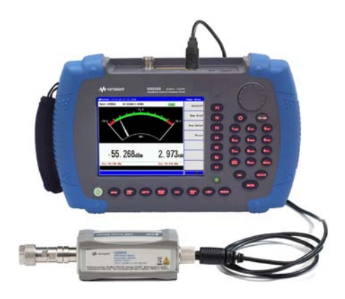
The N9330B supports U2000 series USB power sensor for high accuracy power measurement.