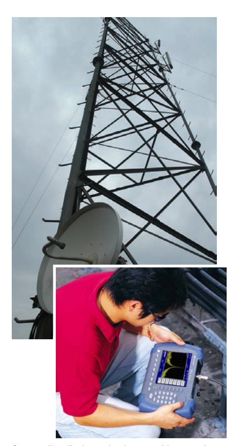
Outstanding display technology provides superior performance under the most demanding lighting conditions.