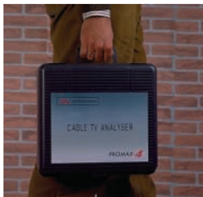
Carrying Case DC-234