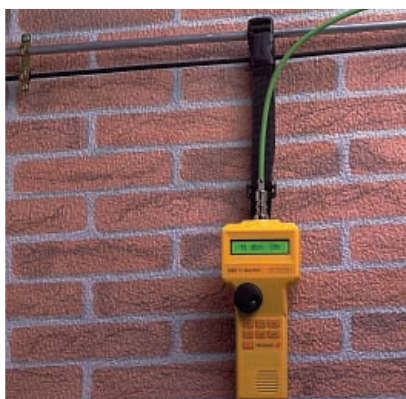
Shoulder Strap DC-286