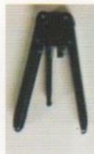
tool of cable stripping