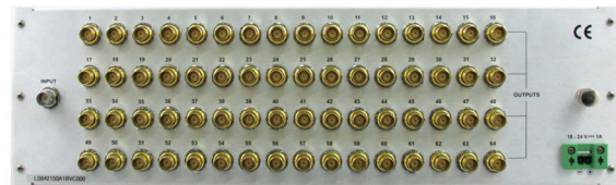
LS64 2150A 64-way Active L-Band Splitter